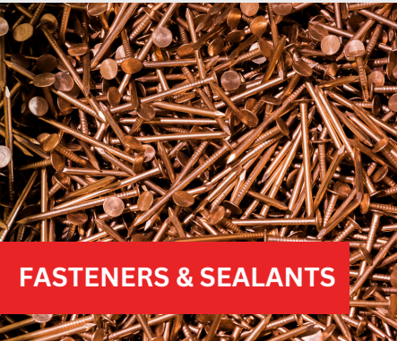
FASTENERS & SEALANTS